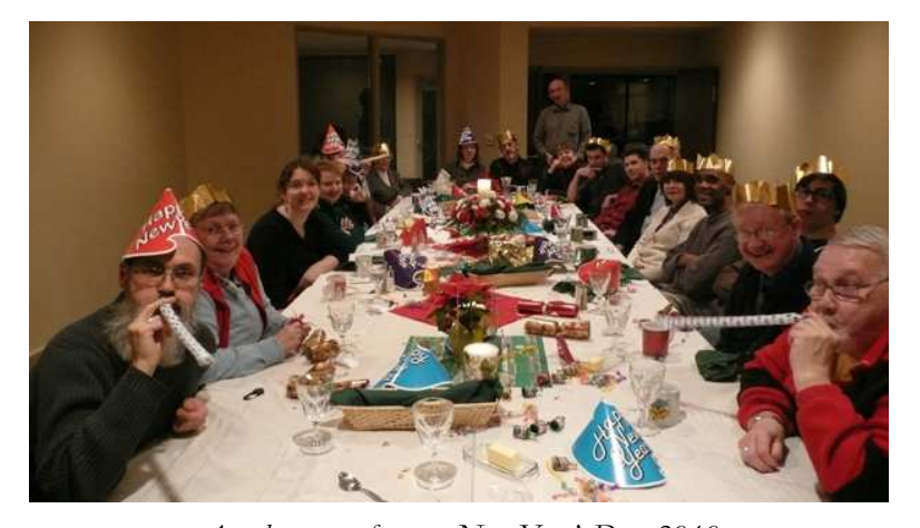
Another year of grace: New Year's Day, 2010