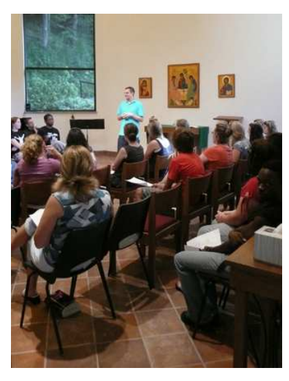
We continue to share our resources with Aliquippa Impact and its ministry to at-risk kids in Aliquippa. College students participate in a two-week orientation and leadership training prior to the summer program. (above) Teaching and worship in the Chapel (below) Group-building exercises in the backyard