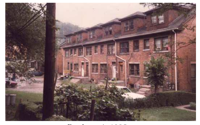
Rowhouses in 1985

ROOTS (Reaching Over Obstacles to Success) Academy, in the swings and roundabouts of joy and creativity, investing in people, play and good neighborliness. We share in local sorrows and amazing joys like yesterday's return of a long-lost friend now cleaned up and taking his meds.